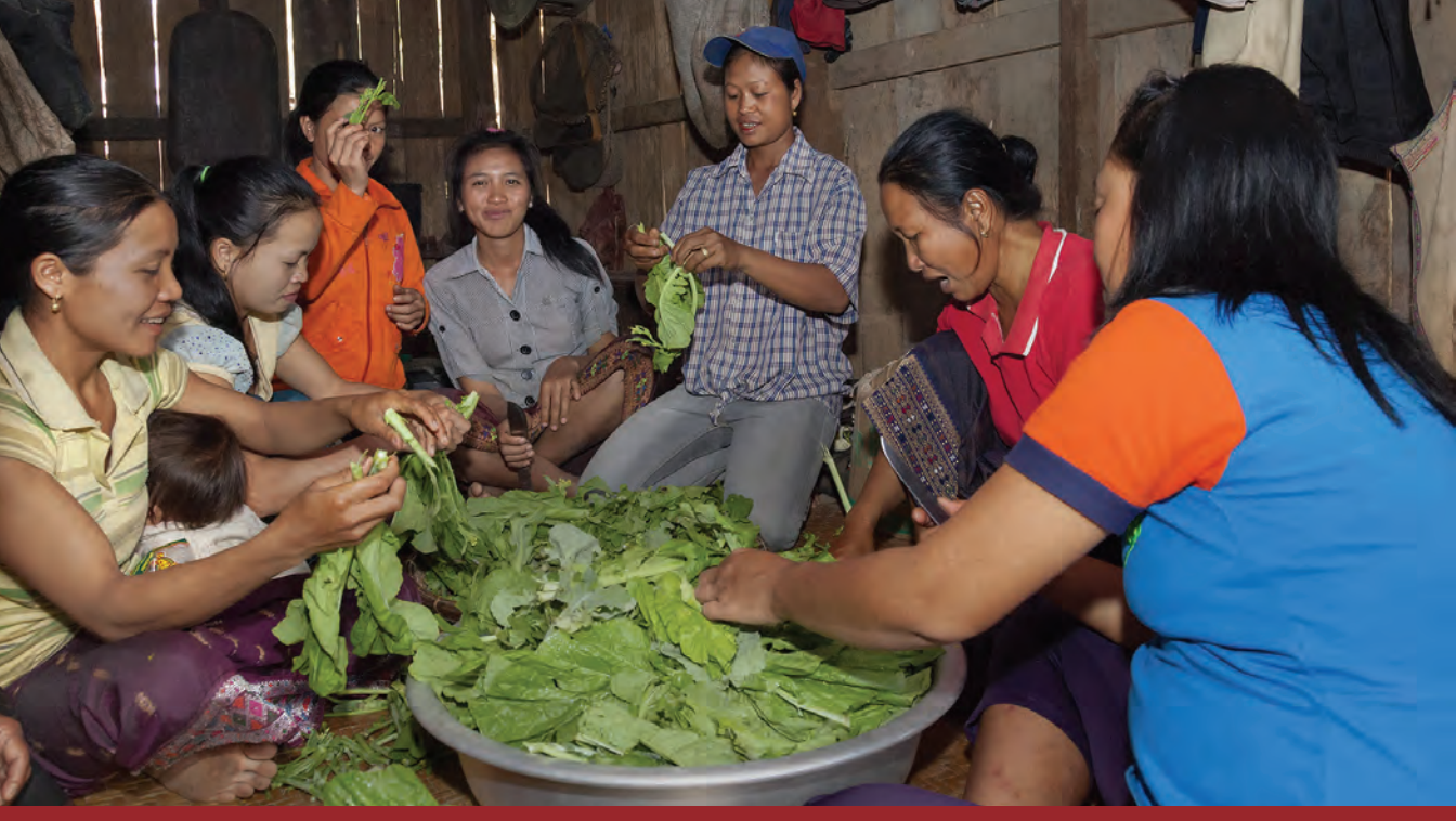
How can the food system agenda for improved nutrition and health best be implemented?

Countries need to implement a set of actions tailored to their needs. Policies need to target food producers, post-harvest handlers, processors, food distributors, and consumers across low- middle- and high-income countries to address the specific challenges of energy deficiency, nutrient deficiency, excessive net-energy intake and unhealthy diets, and food safety issues that each country faces (figure 1). The overall objective across all countries is the same: to feed every person, every day, everywhere with a safe, nutritious, and affordable diet. Achieving this objective will require a tailored set of policies and investments by country.