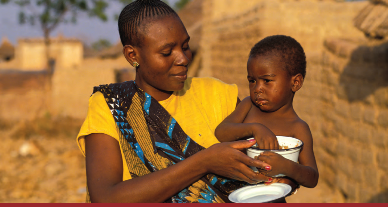
Why does the global food system need to focus on delivering improved nutrition and health?

Despite significant progress the world continues to bear a triple burden of malnutrition. These three burdens are related, but distinctly different, problems1: energy deficiencies (hunger),2 micronutrient deficiencies (hidden hunger),<sup>3</sup> and excessive net energy intake and unhealthy diets4 (overweight/obesity).5 Despite significant progress, 795 million people still are not getting the minimum dietary energy needs. 6 The majority of these people are in Sub-Saharan Africa, in which 1 in 4 people are hungry; and in South Asia, in which 1 in 6 people are hungry. More than 2 billion people are deficient in key vitamins and minerals<sup>7</sup> that are necessary for growth, development, and disease prevention.