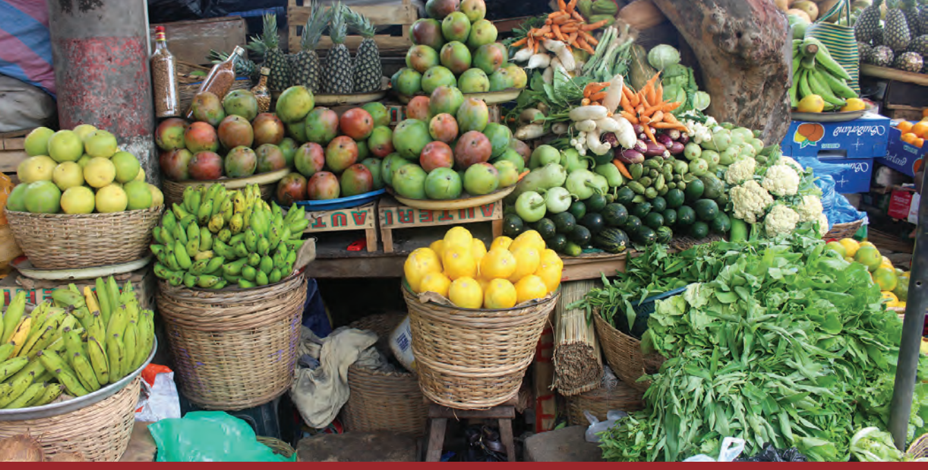
What types of interventions in the food system can deliver improved nutrition and health?

Feeding every person, every day, everywhere, with a safe, nutritious, and affordable diet requires interventions beyond those needed to raise incomes. Ensuring the production of sufficient quantities and diversity of food remains fundamental. Ensuring production is a necessary input for diversified food consumption, particularly by nutritionally vulnerable population groups, including women and children. Higher agricultural production growth has been shown to reduce stunting when initial levels of production are low.<sup>27</sup> For the poorest countries, income growth helps reduce the prevalence of calorie deficiency, and in most of these countries, agricultural growth plays a key role in this income growth.28 However, as prevalence rates decline, undernutrition becomes less responsive to income growth, and impacts are much smaller for lower levels of growth.29 As noted above, income gains alone are far from sufficient to end undernutrition. Multisectoral nutrition-specific<sup>30</sup> and