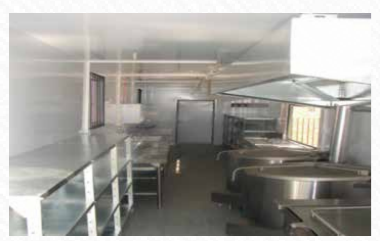
Kitchen provided by Tiger Brands Foundation